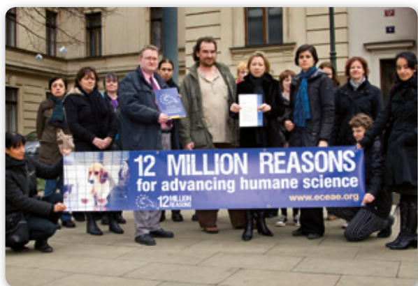
Event in front of the seat of Czech government on the occasion of ECEAE meeting in Prague

For ban on primate experiments in the EU