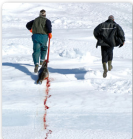
Footage – Commercial Seal Hunting Goes against the Hair with European Public campaign

The aim of this campaign, which was finally attained also due to the effort of Freedom for Animals, was the enforcement of the ban of the trade with seal products in the European Community. The ban came in force in May 2009. The European Community obviously showed Canada (and other countries, in which the commercial seal hunting is still taking place) that EC don't agree with cruel practices of killing seals. The Campaign Commercial Seal Hunting Goes against the Hair of European Public started on the 2nd February 2009 in the cooperation with IFAW (International Fund for Animal Welfare, www.ifaw.org ). To show the success of the campaign, we mention here some statistics: from the website www.protisrsti.cz 10,000 e-mail requests were sent (the number from 5th May 2009) to the Czech MEPs to support the totally ban of the trade with seal products in the European Community; the website was visited by 31,966 people (number from 18th May 2009), we sent more than 230 packets with printed material (posters, leaflets...) to the volunteers who distributed it to the wider public.