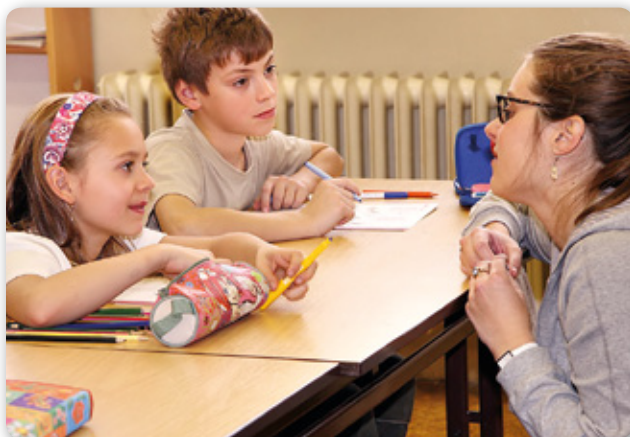
Children with teacher of educational program