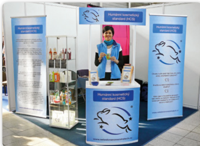
Participation at the fair Cosmetics 2009