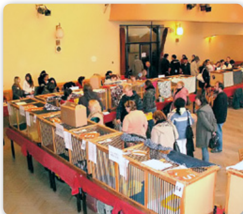
Allocation exhibit of stray cats

For more information visit: www.kocici.cz or write to: info@kocici.cz