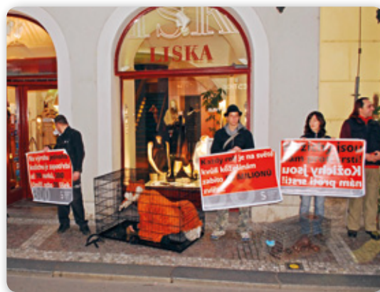
Prague happening at the occasion of Fur Free Friday