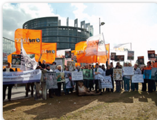
Demonstration in Strasbourg

Within our projects, we cooperate with the European Coalition to End Animal Experiments (ECEAE) and with Inter-NICHE (International Network for Humane Education).