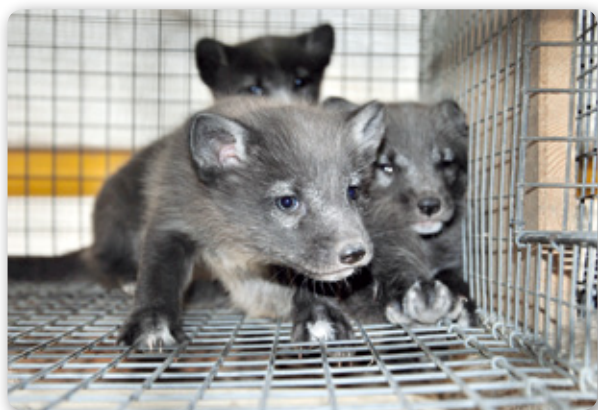
“Life” of animals in fur farm

In February, we started a brand new web page dedicated to the fur issue only – www.protisrsti.cz . Its visitors can find there survey reports of international legislation related to the protection of so-called fur animals, both Czech and foreign public opinion polls, information about welfare of “fur animals”, about the impact of fur production on the environment, about ethic and economic aspects of fur fashion, and also about how it looks like on Czech fur farms. Various pictures or videos from fur farms can be found on the web page as well as several useful advices on how to contribute to the (not only) “furanimals” protection. A special section is devoted to the seal protection (see below).