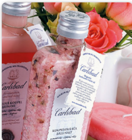
Products of Manufaktura company – first Czech cosmetic company to gain the HCS certificate