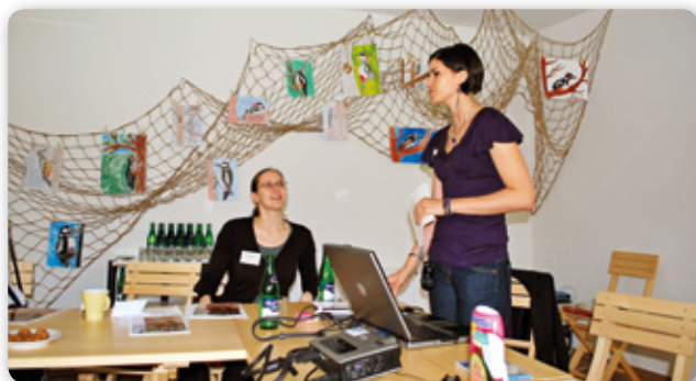
Meeting of Freedom for Animals' members

Inquiries and information materials: info@svobodazvirat.cz , promotional materials: e-shop@svobodazvirat.cz