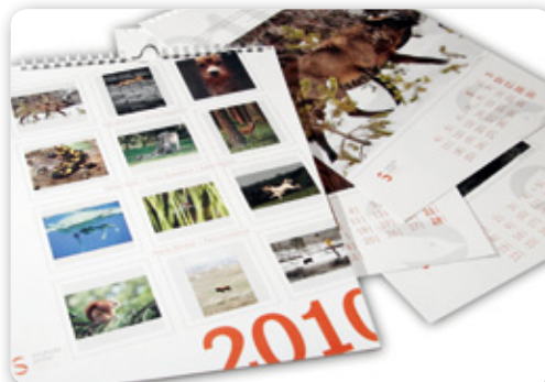
Benefit calendar for 2010